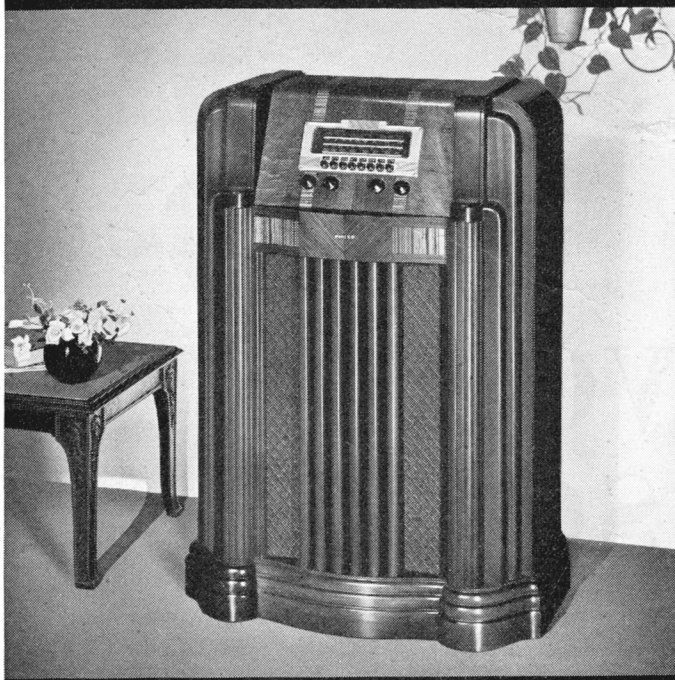
1940 PHILCO CONSOLE, Model 190XF