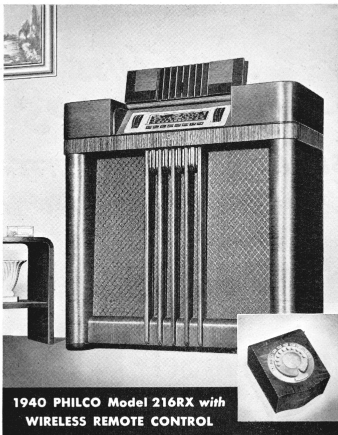
1940 PHILCO Model 216RX with WIRELESS REMOTE CONTROL