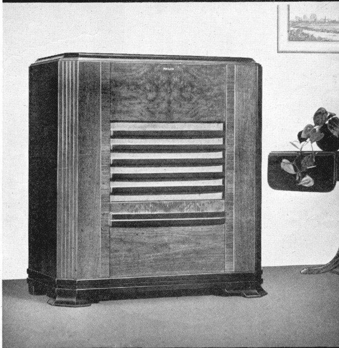
PHILCO RADIO-PHONOGRAPH, Model 507