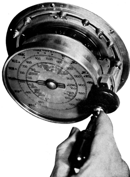
Fig. 2—Tuning Handle and Wrench Engaging stop