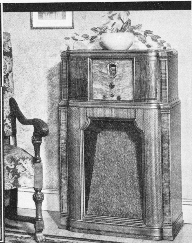
PHILCO 16X - $150

WHEN you think of PHILCO, you may think of one of the magnificent, powerful (Inclined Sounding Board) X Models—the radio that is truly the finest of musical instruments—the radio that is supreme in its ability to reproduce all broadcasts with perfect fidelity to the original.