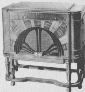
506—American and Foreign All-Wave 507—American and Foreign All-Wave 503—American

ALL CONTROL OF VOLUME AND TONE ON RECORDS IS OBTAINED FROM THE REGULAR KNOBS used for the radio volume and tone control—no other controls are added to complicate matters.