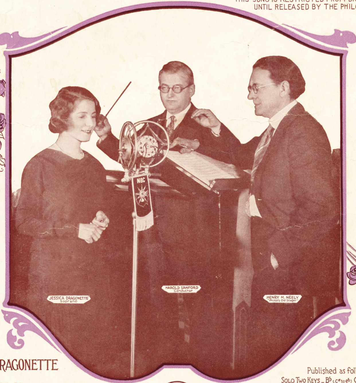
JESSICA DRAGONETTE Soprano

THIS SONG IS RESTRICTED FROM BROADCASTING UNTIL RELEASED BY THE PHILCO CO.