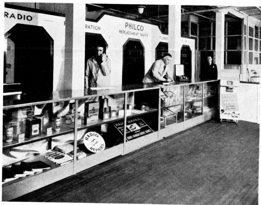
Parts Division, Anthony Foster & Sons Limited, Philco Distributors in Toronto

This fine spirit of co-operation with dealers and servicemen can only be found in the finest distributing group in the country—Philco Distributors.