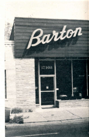
Jack Barton's swar if "big busine