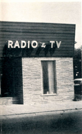
ink shop looks as "business" is good!