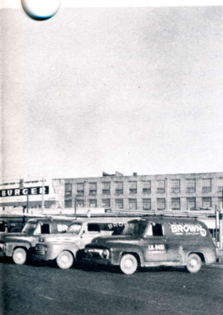
Service trucks ready for service operations.