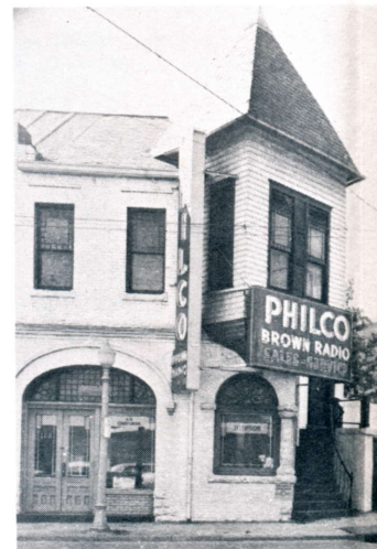
Brown's Sales and Service from service alone four times did when Brown offered

2. Desire and ambition to go further and assume the added responsibilities that increase in ratio to expansion of business takes a decided drop in this group. But this attitude is quickly corrected when a complete concise business program is laid out for the individual.