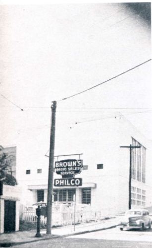
Service Center grosses four times more than it cost to run exclusively.

Your electronic and appliance service parts and accessory business is a big business which you can make profitable and exciting for yourself by being good salesmen, good advertisers and good merchandisers.