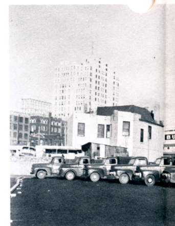
Brown's fleet of service vehicles on a busy day of big business