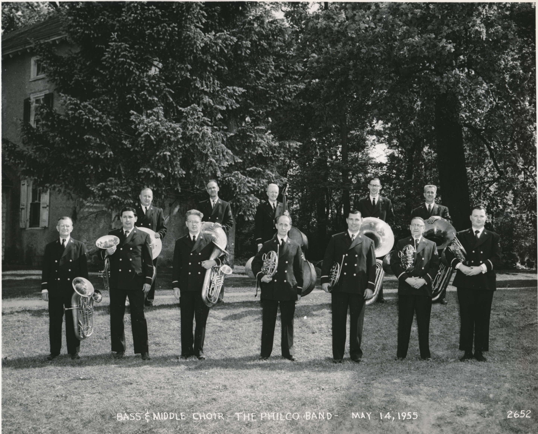
BASS & MIDDLE CHOIR - THE PHILCO BAND - MAY 14, 1955