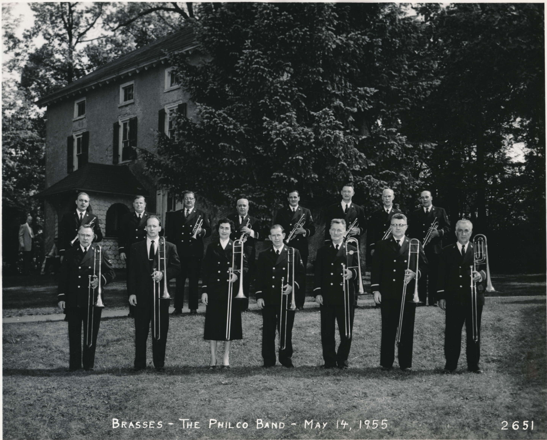
BRASSES - THE PHILCO BAND - MAY 14, 1955