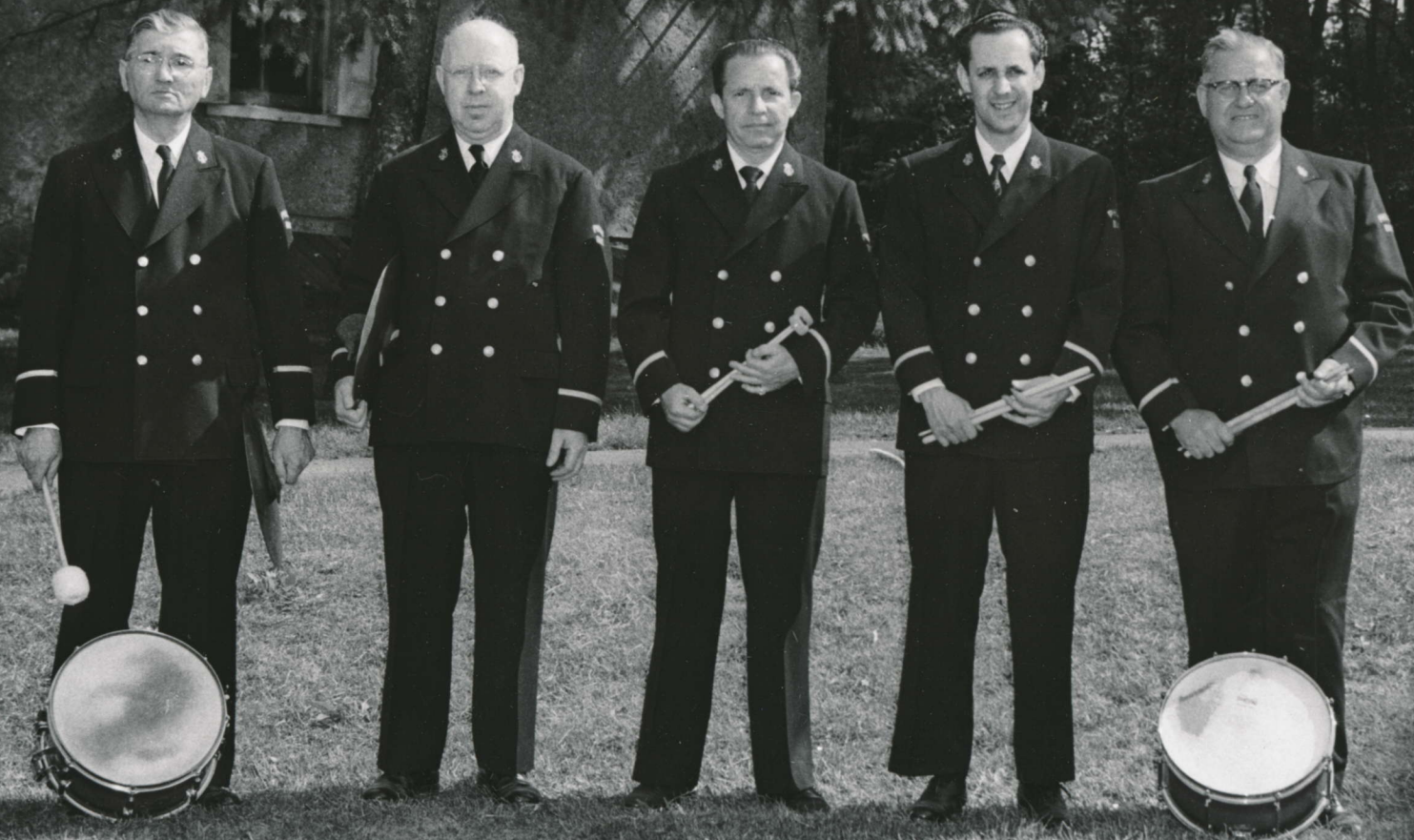
PERCUSSION-THE PHILCO BAND - MAY 14, 1955