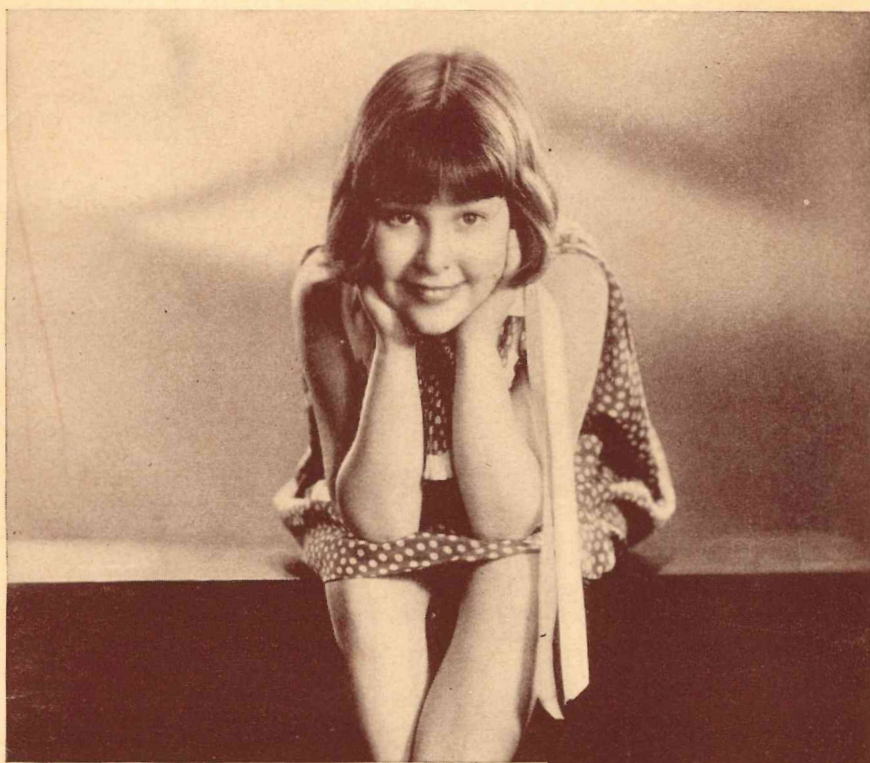
TWO GREAT LITTLE STARS

MITZI GREEN, FEATURED IN THE PARAMOUNT PICTURE "TOM SAWYER," AND PHILCO BABY GRAND... When Mitzi Green, child wonder of the screen, goes on the air, a radio set whose units are but partially balanced can only bring you the distorted tone pictured at the left. With Philco's exact balancing of all units in the set, you get the true, clear, undistorted tone pictured at the right