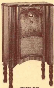
PHILCO BABY GRAND CONSOLE

What do we mean by "big performance?" Simply this: Philco Baby Grands have the gorgeous, life-like tone characteristic of the whole Philco family. They have Philco Balanced Units, eliminating radio distortion.